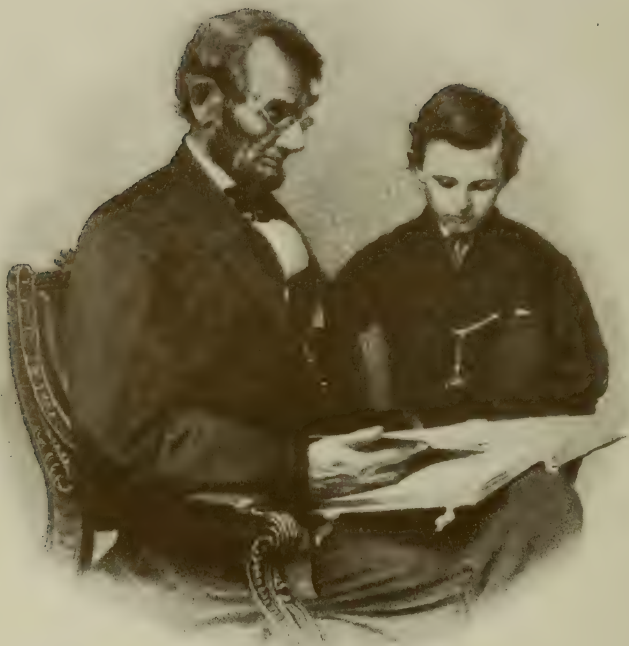
PRESIDENT LINCOLN AND HIS SON "TAD."